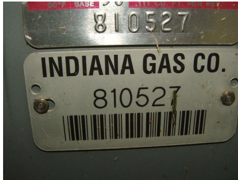
5. Gas Meter