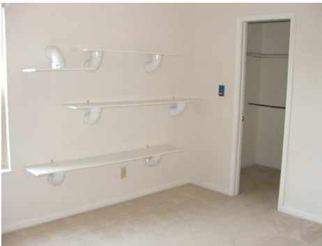
27. Bedroom 2