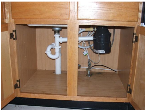
19. Under Sink