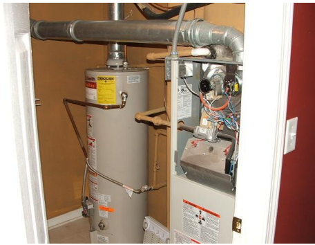
13. Utility Room