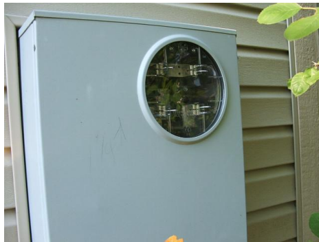
2. Capped Meter