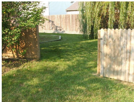
8. Missing Fence Section