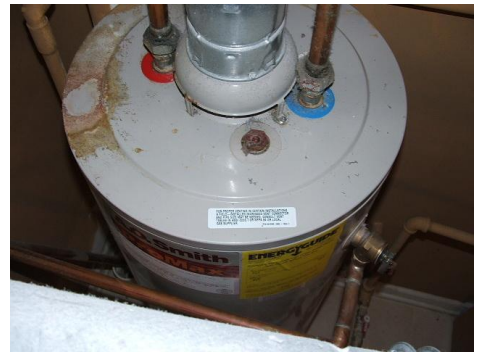
15. Water Heater