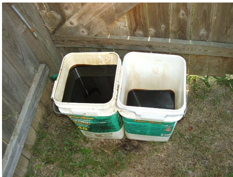
7. Buckets Of Oil On Site