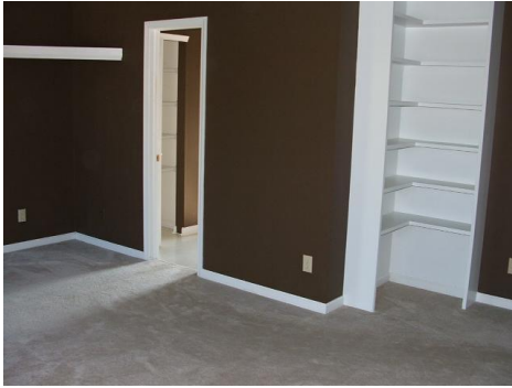
29. Bedroom 4