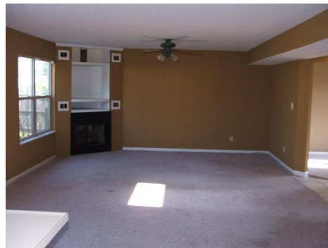
20. Family Room