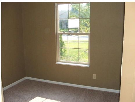
22. Living Room