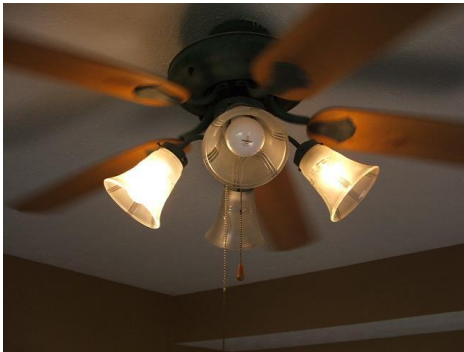
32. Light Lit