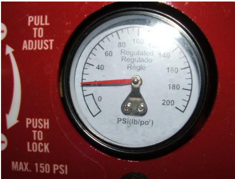
31. Pressurized Plumbing