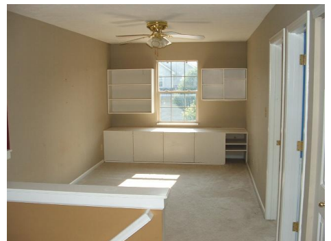
24. Bonus Room