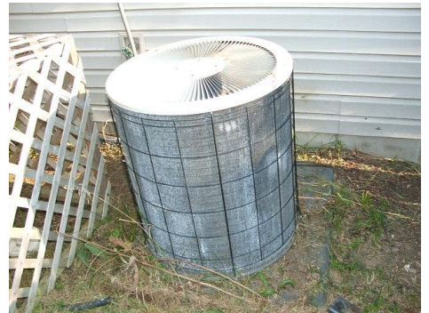
6. Air Conditioner