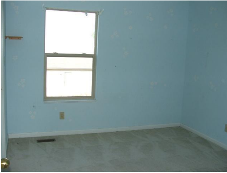
28. Bedroom 3