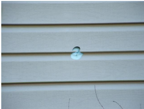
4. Siding Damage