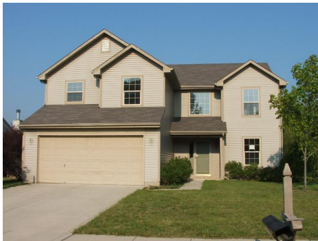
1. Front Elevation