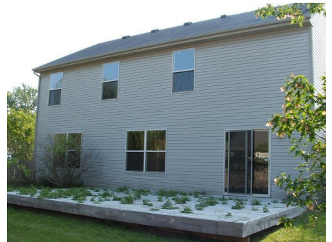
3. Rear Elevation