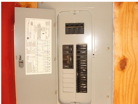
10. Panel Box