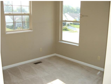
25. Bedroom 1