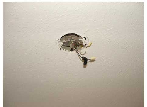
21. Missing Fixture